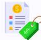
Create POs w/o Prices