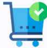
Auto Recurring Orders