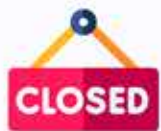
Close POs Your Way