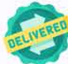
Accept Partial Deliveries