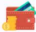
Employee Expense Reimbursement