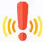
Real-Time Procurement Alerts