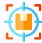
Track Orders Seamlessly