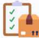
Edit POs on the Fly