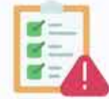
Automated GST Compliance