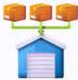
1-Click Multi-Vendor POs

POs streamline procurement by facilitating precise ordering, tracking, and management of goods and services, enhancing efficiency and accuracy in business operations.